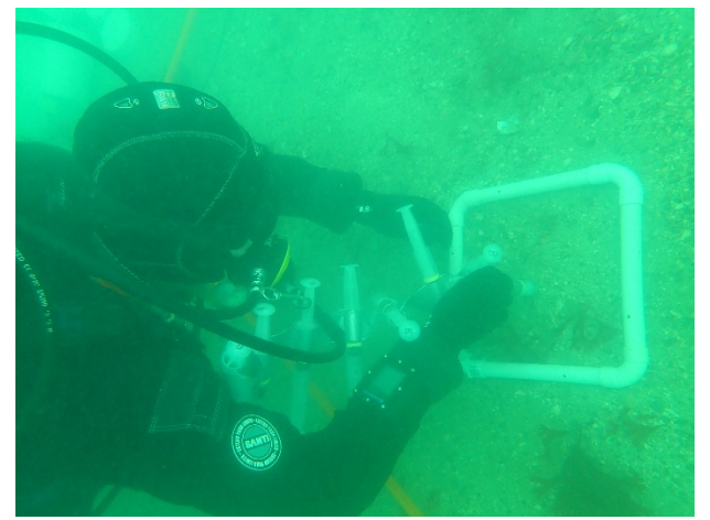
Figure 4: Diver taking sediment samples in a control plot to measure differences in the sediment that are occurring under the mussel beds versus the surrounding area.