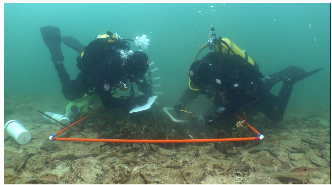
Figure 2: NIWA divers measuring mussels to look at growth at the Grant Bay site. This photo is taken after they had removed and bagged the starfish that were on the mussel plot.