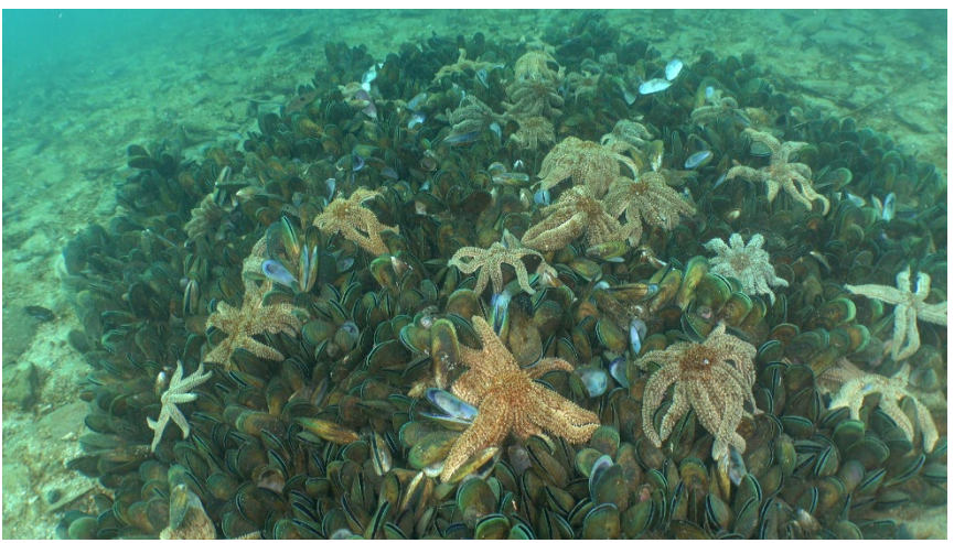
Figure 3: A restored plot at the Grant Bay Site before the starfish were removed.